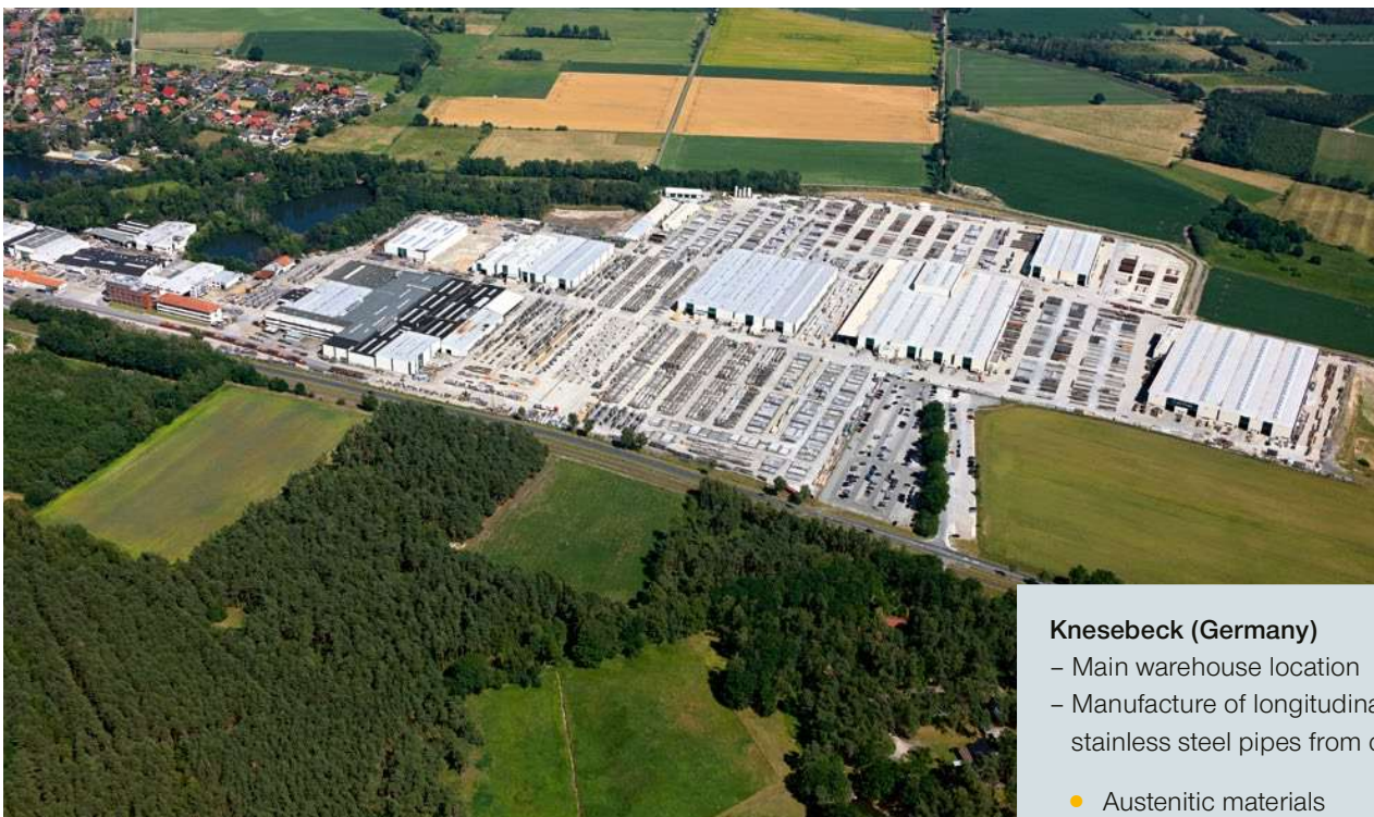
BUTTING in Knesebeck (Germany)