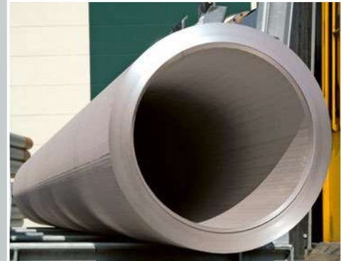
Plates are edged or formed and then welded into pipes