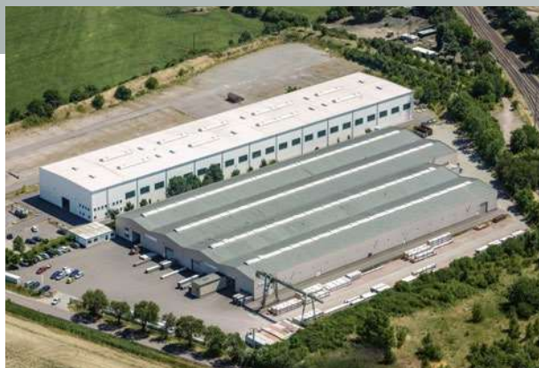
Production site in Könnern (Germany)